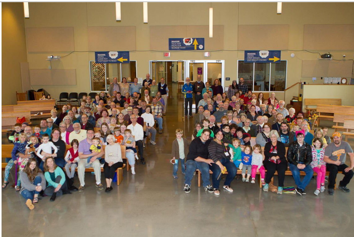
2017 Congregation Photo