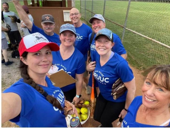
Photo of the ORUUC Team, Spring 2022