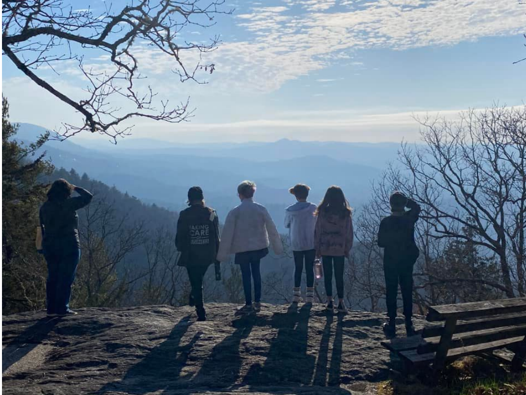
ORUUC Middle School Youth at MountainCON, March 2022

CONs are back at the Mountain! REGISTER for Fall CON TODAY: https://www.themountainrlc.org/cons .